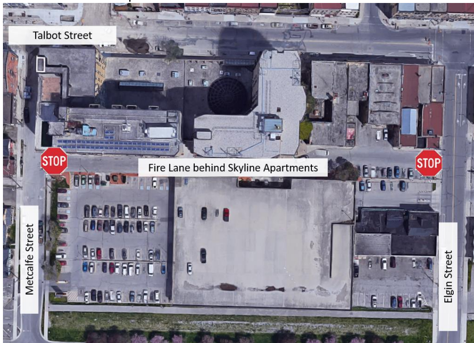
Figure 3: Proposed Traffic Control for lane south of Talbot Street 300 Block

Stop control signage will be posted for eastbound traffic behind the 300 Talbot St. Block, in the lane at its intersection with Elgin Street and Stop control signage will be posted for the westbound traffic at the intersection of the lane and Metcalfe Street as shown in Figure 3 . An amendment to the Traffic and Parking By-law is needed to facilitate the installation of the Stop Control in the lane behind the 300 Talbot St. Block